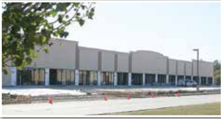
New Retail Construction - Sulphur

West Calcasieu Parish provides an unprecedented opportunity for businesses in Louisiana.