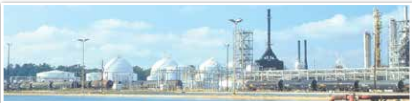
Sasol North America - Westlake

The combination creates a healthy economy and adds to the commercial backbone of southwest Louisiana.