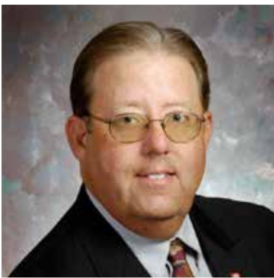
Kenny Stinson Mayor Town of Vinton