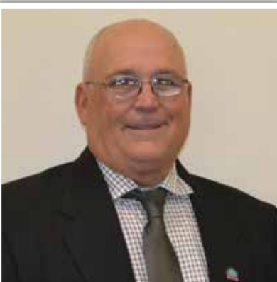
Bob Hardey Mayor City of Westlake